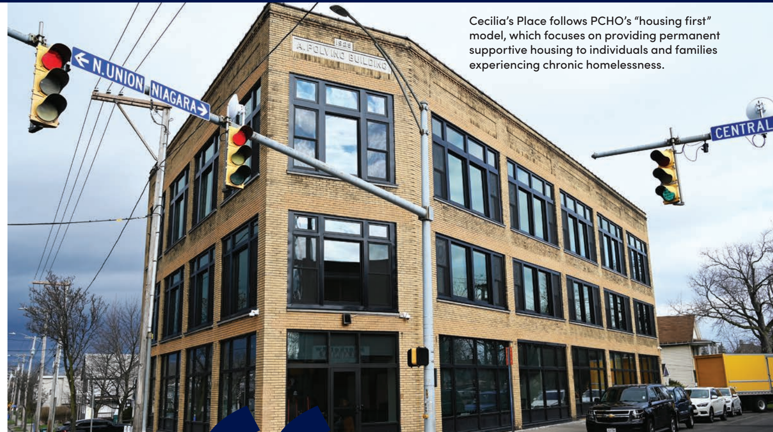
Cecilia's Place follows PCHO's "housing first" model, which focuses on providing permanent supportive housing to individuals and families experiencing chronic homelessness.