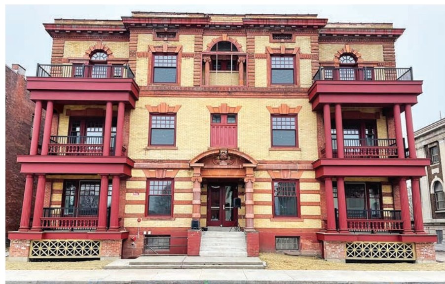
Arbor Housing and Development completed renovations in spring 2024.