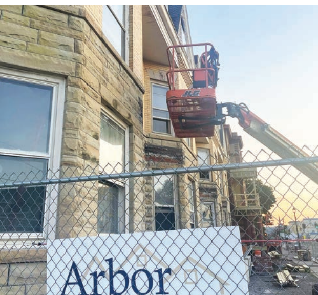
Construction on Reynolds Way Apartments began in December 2022.

The development advances the City's goal of preserving historic buildings while increasing housing options and is located within Elmira's Downtown Revitalization Initiative target area. ■