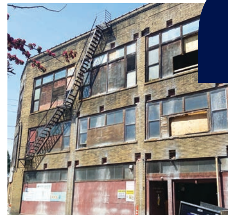
Rehabilitation of the former Polvino Building on Central Park began in 2022.