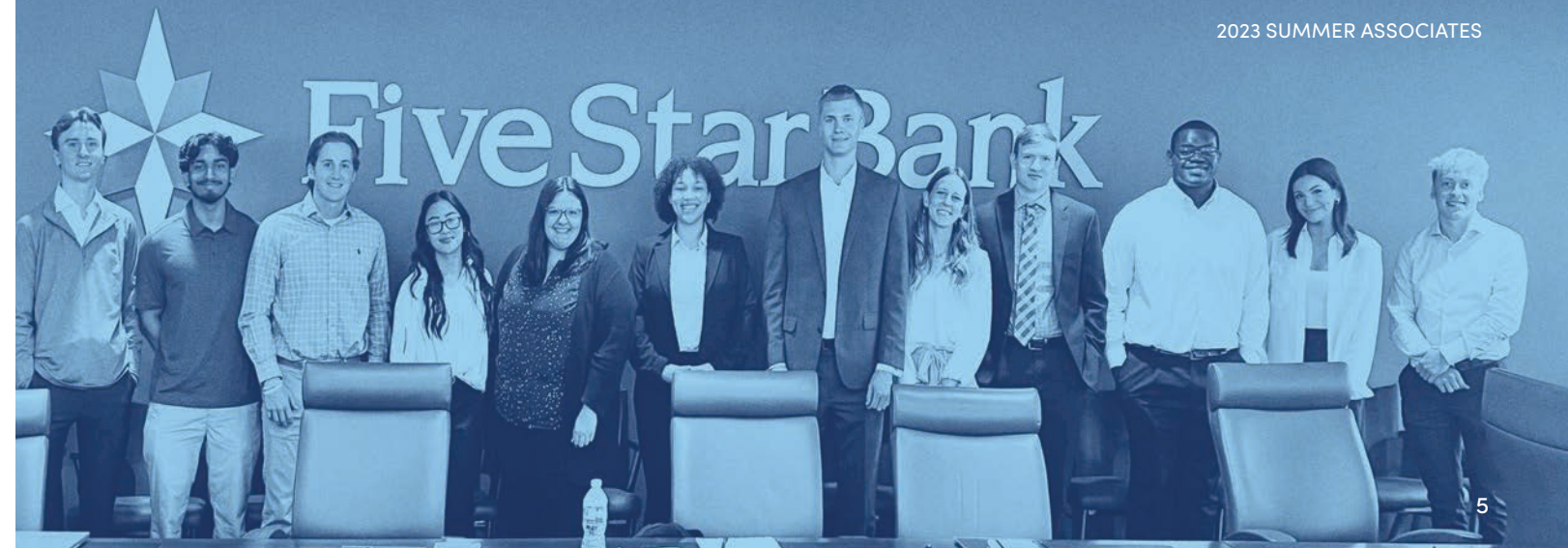
2023 SUMMER ASSOCIATES

The hallmark of our campus recruiting efforts is our Summer Associate Program, which has been thoughtfully designed to provide students with real work experience that prepares them for a career in financial services. Our summer program includes one-on-one mentorship, professional development workshops, and events to engage in networking, volunteerism, and enhance team building skills. Our 2023 class of summer associates worked across a variety of business lines and functions at Five Star Bank, Courier Capital and SDN Insurance, culminating their experience in a capstone project and presentation to our executive leadership team.